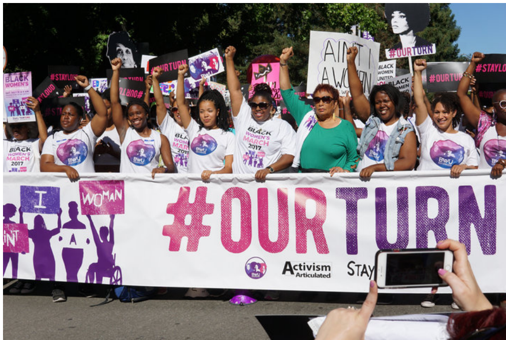
ANGEL RODRIGUEZ Black Women United organized Sacramento's first march for black women's rights.

More than 1,500 people gathered on Saturday to participate in a black women's rights march in Sacramento.